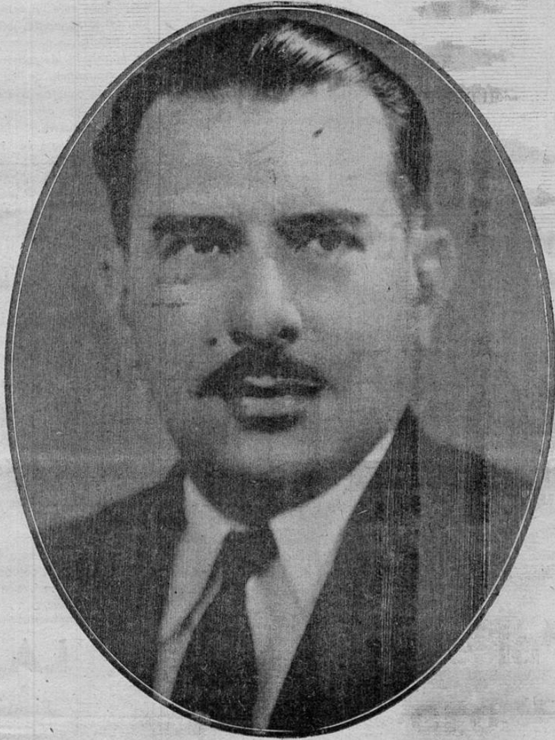
Licenciado Don TEODORO PICADO

al señor Presidente de la República Lic. don Teodoro Picado con motivo de su visita a esta ciudad